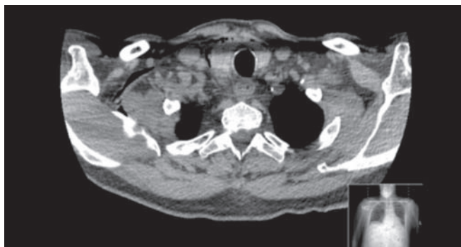
Figure 2: CT of neck and thorax showing surgical emphysema in the prevertebral, hypopharyngeal and lateral facial planes of neck mostly on the right side