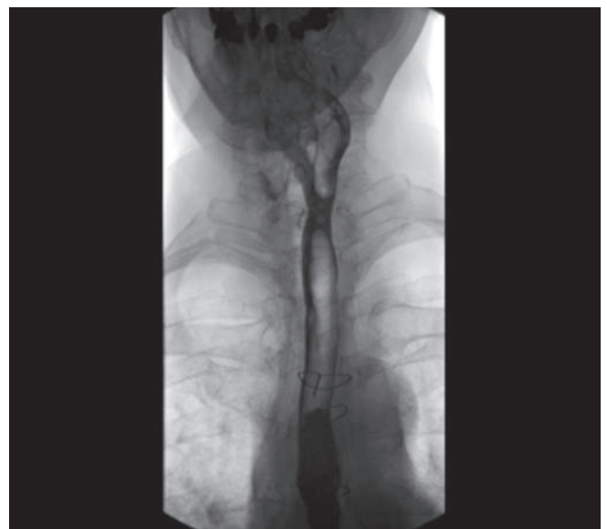
Figure 4: Water soluble contrast swallow showing free flow of contrast down to pharynx and oesophagus